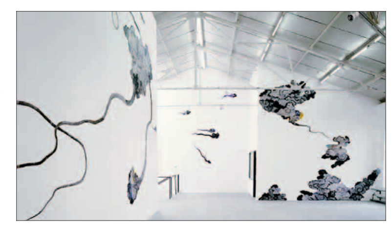
Mainland photographer-painter Shao Yinong (top) began his celestial studies in Beijing earlier this year with the exhibition entitled Between Earth and Sky - Beginning of Summer.

comprise all 24 Solar Terms and their social significance, divided into seasonal sequences with colourful clouds, lucky clouds and dark clouds, Shao says. Having opened with the Beginning of Summer in